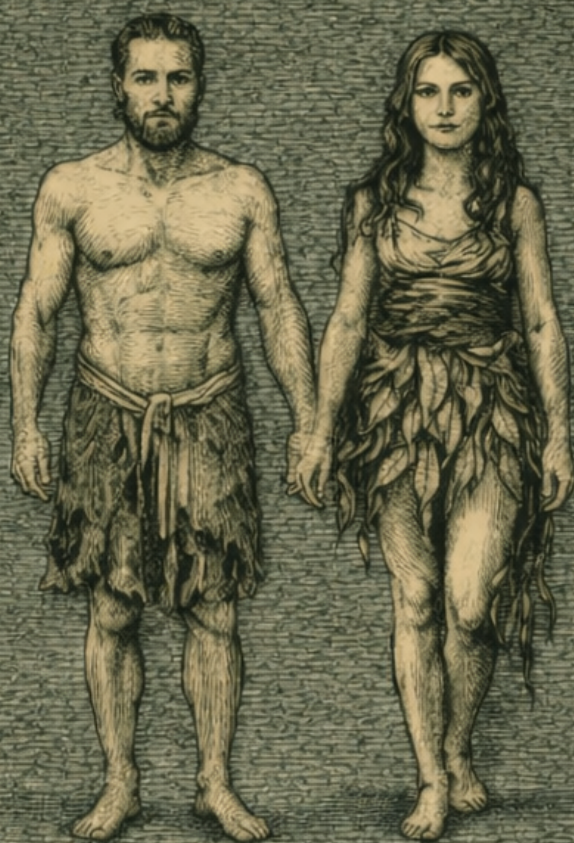
ADAM & EVE